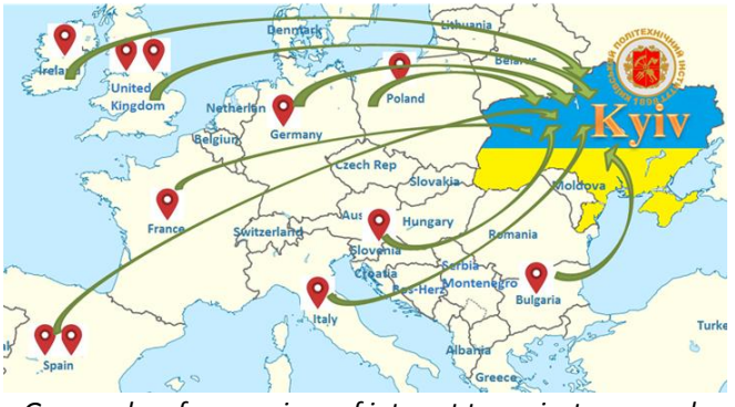
Geography of expressions of interest to project proposals from Ukraine

Apart from that, the same team of partners provided assistance to Ukrainian stakeholders in preparation of 43 Expressions of Interest (EoI) to participate in Horizon 2020 Programme in the societal challenge